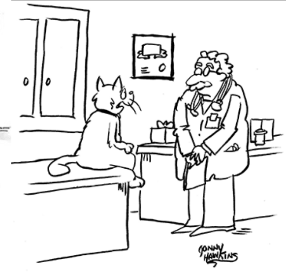
"I just have to know—why is curiosity a killer amongst cats?"